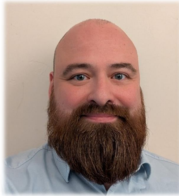
Team Lead Vessel IT MaDaTec