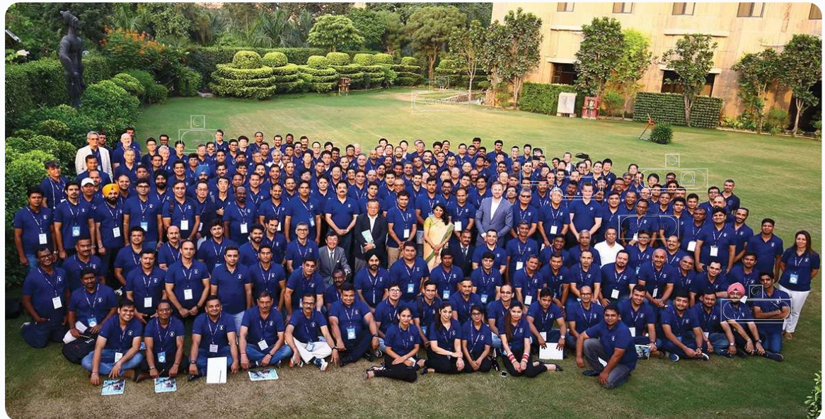
● Headquarters ● Regional office